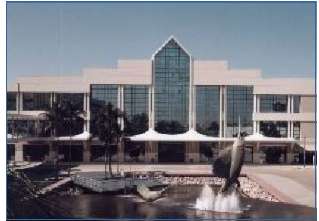
Broward County Convention Center